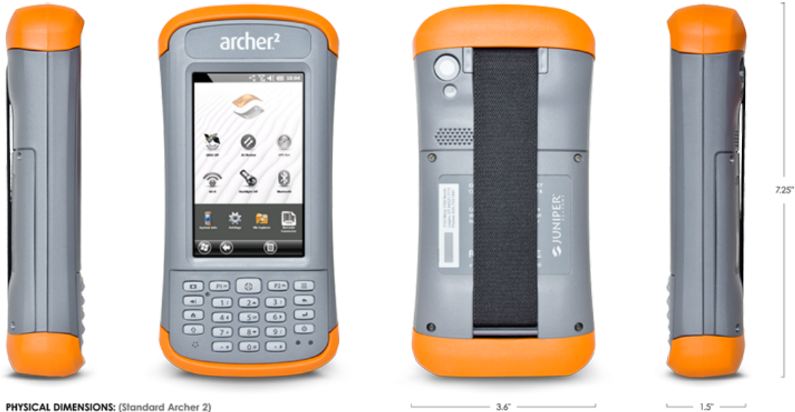
PHYSICAL DIMENSIONS: (Standard Archer 2)